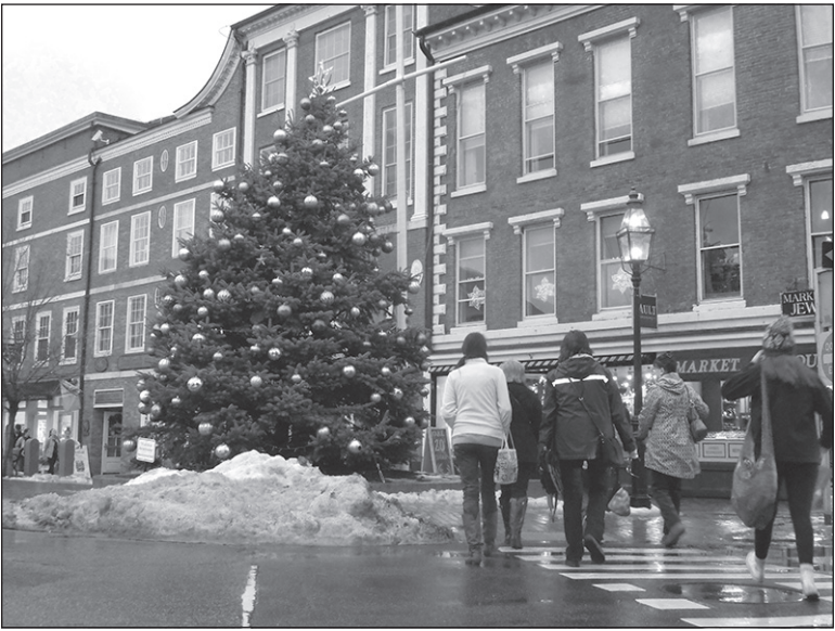
A few grimy snowbanks do not a White Christmas make, but the dutiful shoppers who trudged damp sidewalks last Sunday did have a listing tree to provide a subtle touch of comic relief.

ban, Luis Posada Carriles, who was born in Cienfuegos just 18 months after El Presidente . If there was any, we missed it.