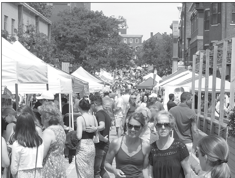
Tens of thousands of visitors strolled through the streets of Portsmouth on Saturday, June 11th, as Market Square Day resumed its traditional place in the city’s annual roster of events. According to our Wandering Photographer, the percentage of them wearing masks was statistically insignificant. Based on the official seven-day average, approximately 277 residents across New Hampshire contracted Covid that same day.

“Rhetoric and misinformation on climate change and the deliberate undermining of science have contributed to misperceptions of the scientific consensus, uncertainty, disregarded risk and urgency, and dissent,” the IPCC report states. “Additionally, strong party affiliation and partisan opinion polarization contribute to delayed mitigation and adaptation action, most notably in the U.S.... but with similar patterns