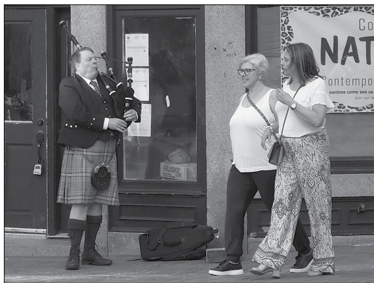
The compelling sound of bagpipes floated through downtown last Saturday, courtesy of this dapper, kilt-clad gentleman. Traffic was still blocked off for Market Square Day, so the sound of the highlands was not disturbed by the mechanical flatulence of Harley Davidsons.

This work appeared originally at CommonDreams.org. It is licensed under Creative Commons (CC BY-NC-ND 3.0). Feel free to republish and share widely.