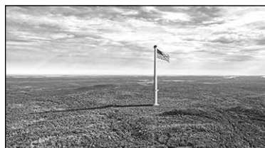
Falls, Maine, pop. 476. It's just a brief four-hour trek up Route 1 from Portsmouth—on a good day.

What lucky locale will be graced by this immense symbol of America's overwhelming and unstoppable... American-ness? Columbia